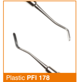
N0255- H N0225- O N0195-R