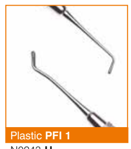
N0243- H N0213-O N0183-R